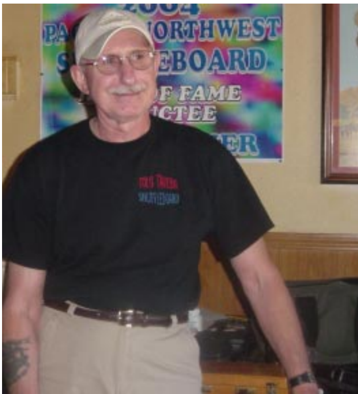
B Singles champion Kenny Rogers