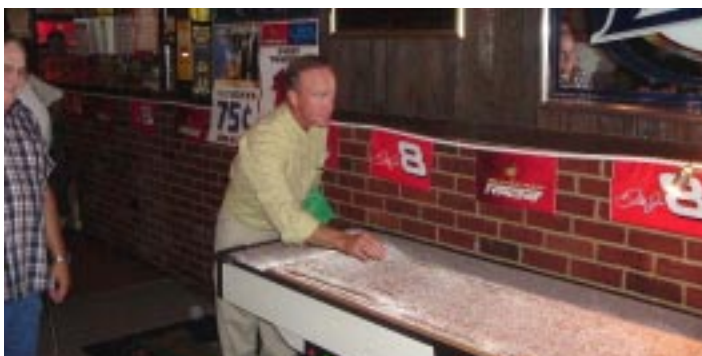
Republican Governor candidate Mitch Daniels stopped in to Journey's End in Bourbon Saturday night in an unannounced campaign stop.