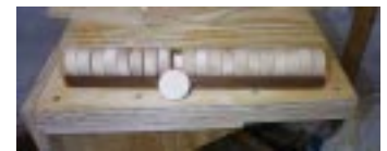
Sjoelbak uses 30 wooden disks.

A Sjoelbak board is a wooden board 6 1/2 feet long by 1 foot,