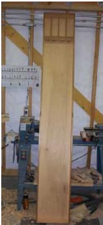
Dutch shuffleboard - Sjoelbak - is quite different from the game known in other parts of the world.